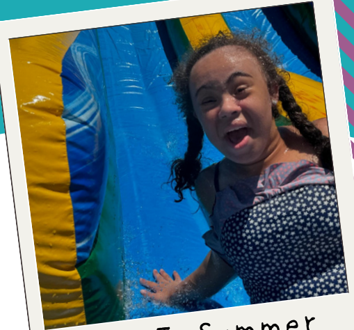
S.E.E. Summer Camp

Thanks to the generous support of Kosair for Kids and Crusade for Children, this summer was full of learning and fun! Our school-aged members avoided the summer slide by attending classes, going on field trips, and making memories!