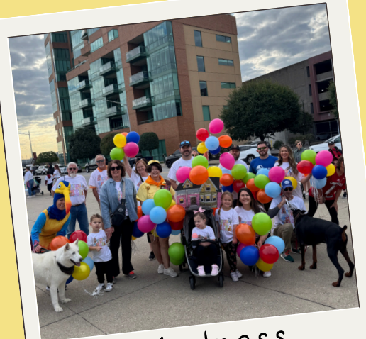
Kindness Warrior Walk

As we walked like the Kindness Warriors we are, we raised awareness and over $280,000! This peer-to-peer fundraising event wouldn't be possible without our wonderful families and event partners. Come walk with us on October 4, 2025, and show your support for DSL!