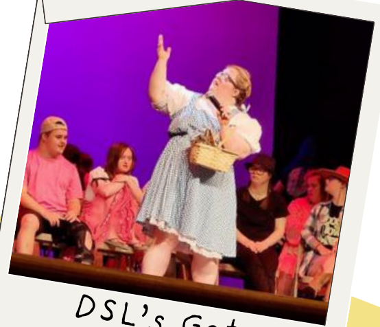
DSL's Got Talent

Every year we get the opportunity to showcase our members' fabulous talents. New Albany High School generously donated their theater to DSL for the talent show. We greatly appreciate them for their support of DSL's talented members!