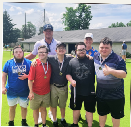
Pro-Celebrity Golf Tournament