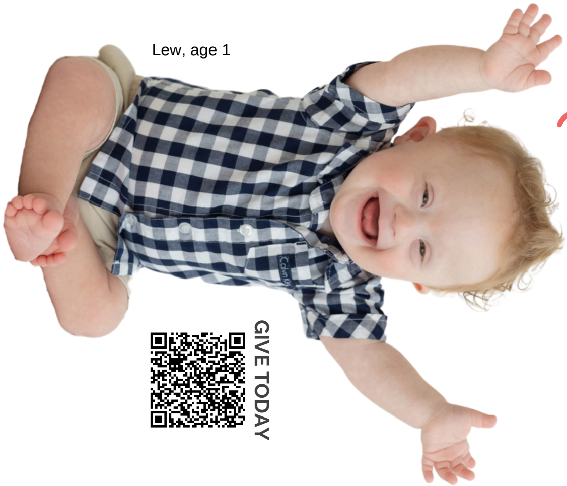
Lew, age 1